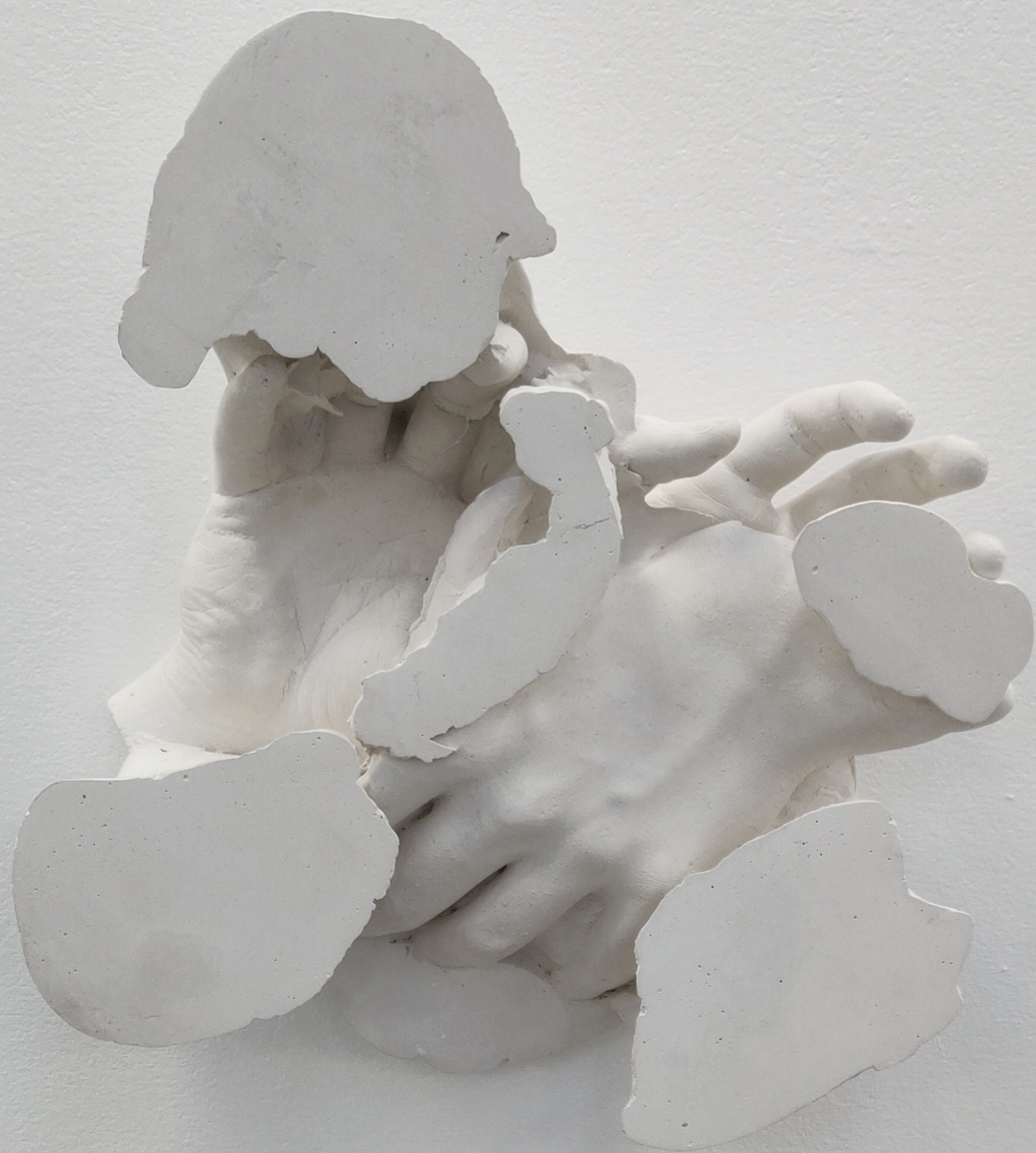
Aron Demetz untitled, 2020 plaster 33 x 37 x 8 cm