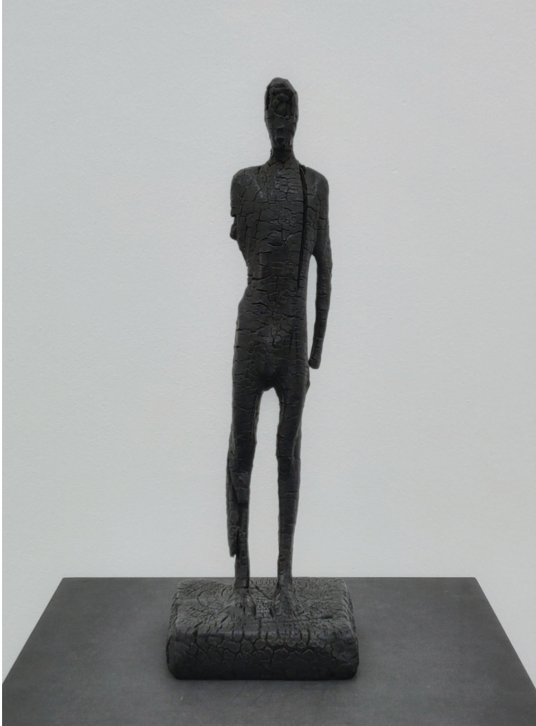
Aron Demetz untitled, 2013, 2013 bronze 40 x 11 x 11 cm