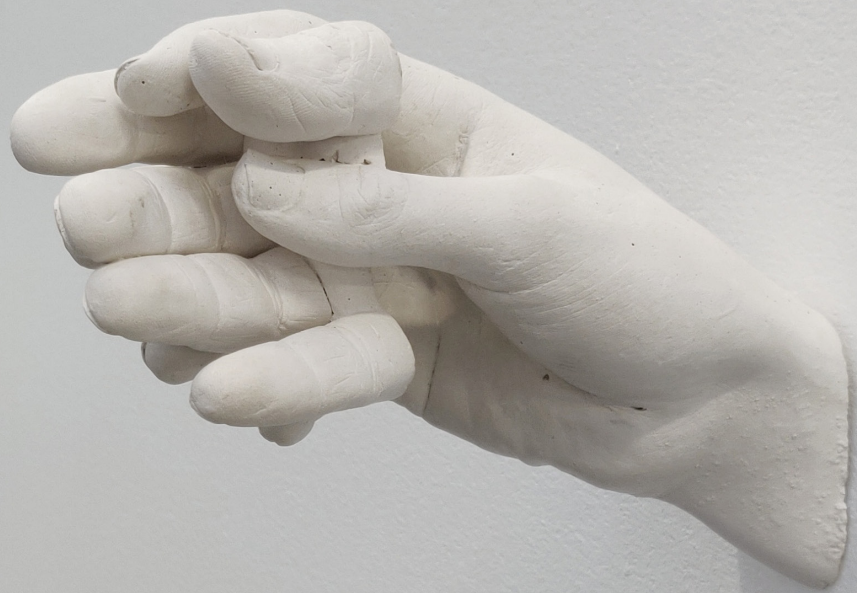
Aron Demetz untitled, 2020 plaster 20 x 10 x 12 cm