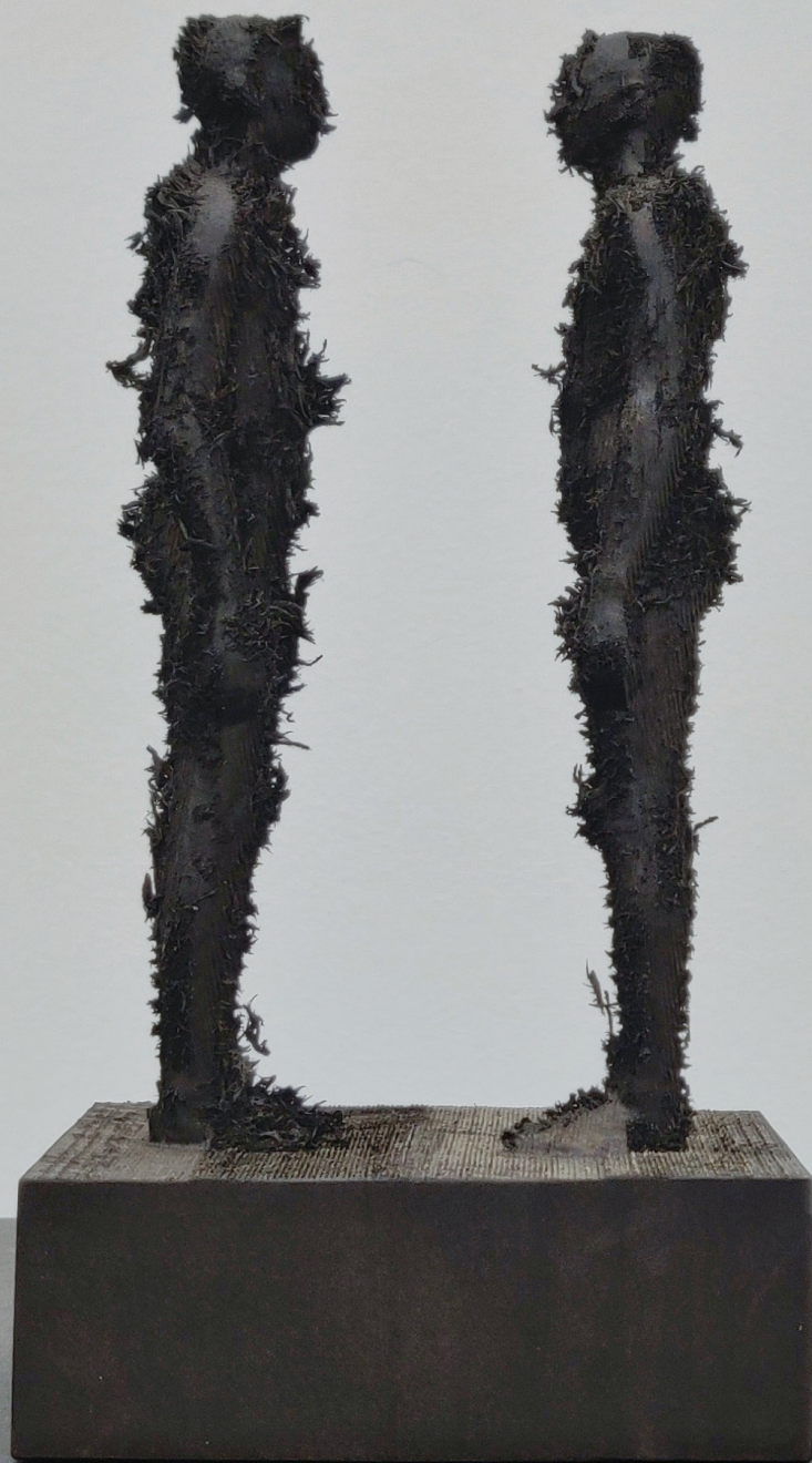
Aron Demetz untitled, 2019 lindenwood, acrylic 22 x 12 x 9 cm