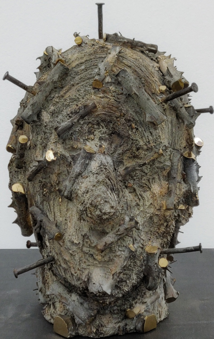
Aron Demetz kopf6, 2020 bronze 30 x 22 x 25 cm