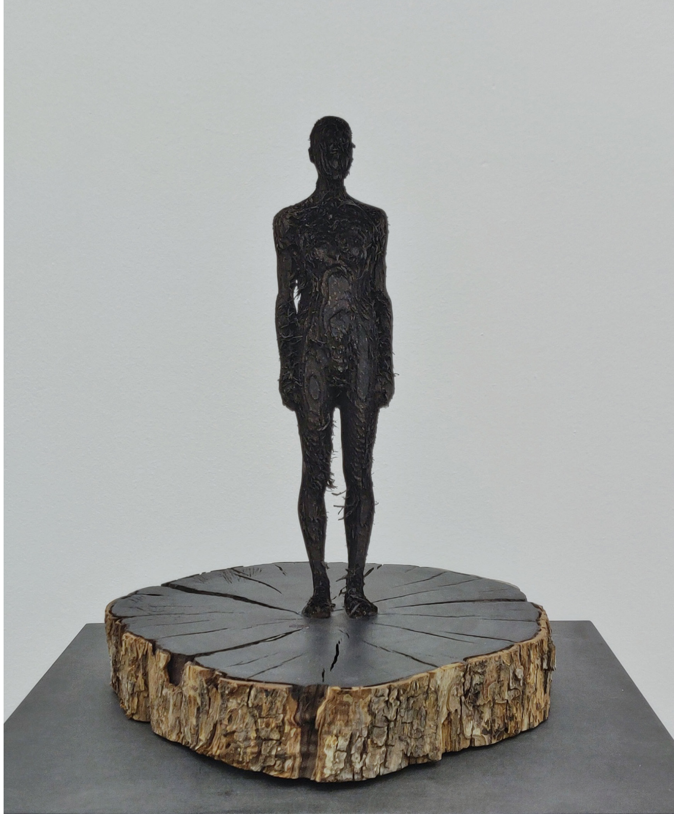
Aron Demetz untitled (advanced minorities), 2017 birch wood, acrylic paint 32 x 25 x 28 cm