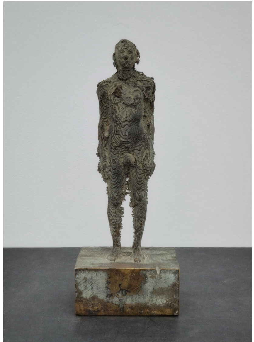
Aron Demetz B, 2020 bronze 23 x 8.50 x 6.50 cm